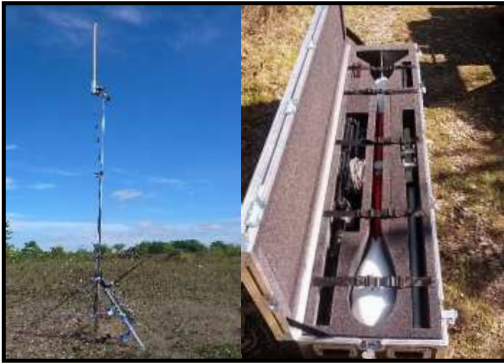
Radio Link ground station antenna and single case for complete storage and shipping.

The AirBIRD comes complete with 1 GSMP-35U Potassium Magnetometer, laser altimeter for altitude tracking/post processing, IMU for bird and sensor orientation, GPS navigation, battery, radio link and tow cable. The magnetometer performs all of the functions of a data acquisition unit. The self contained, self powered stand alone system does not require any integration with the UAV's navigation or electrical systems.